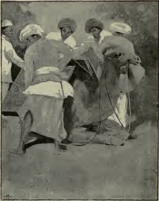
A HEALTHY AND VIGOROUS-LOOKING CAMEL.

mixed them up with whatever he had last had to drink ; and it did not take a moment's observation to convince me that they were